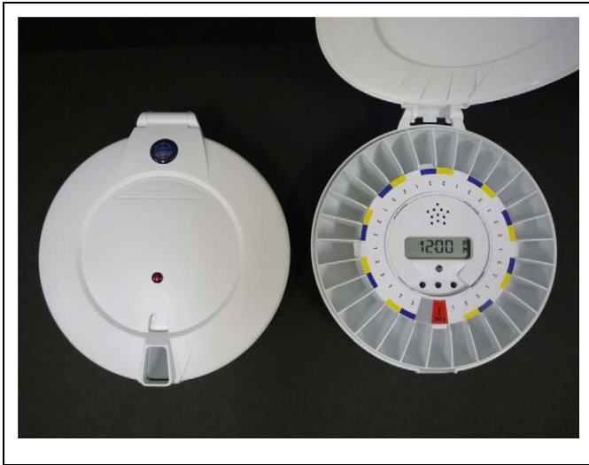
Figure 1. The automatic pill dispenser is 190 × 180 × 56 mm and 480 g (including batteries). Left: the device in closed position. Right: the device in open position to set the alarm and insert medication. The device can be locked using a key.

the operation of the reminder device, no fixed dosing time or place, medication in a form other than tablets or capsules, and no caregivers to fill the device with tablets or capsules.